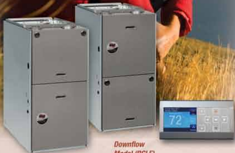
Upflow/Horizontal Model (RGPE)

Your life stays in motion. Yet you stay in total control. Cool and calm at the center of any storm, completely at home in your environment.