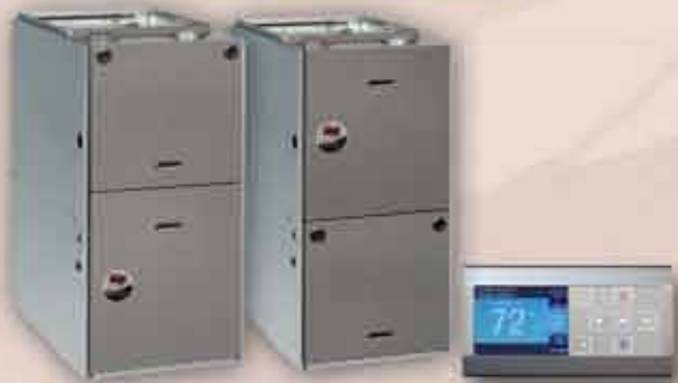
Upflow/Horizontal Model (RGPE)