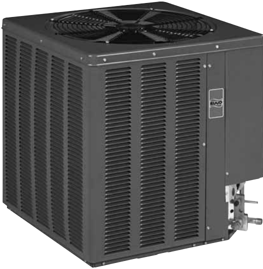
Note: Above image does not show deep drawn basepan.